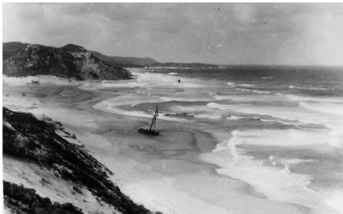
Above: Photo of the Mandalay Ship wreck ca.1912.

“It took the ground about 180 m from the beach, bumping hard. This resulted in the loss of the mainmast overboard, but the hull seemed to be still intact, or at least with only minor damage,” the records state.